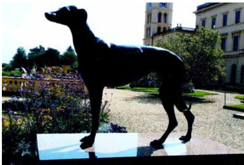
Spotted by Marion Blackett, at Osborne House Isle Of Wight.