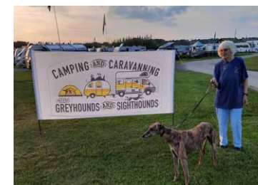
Photo 1 See if you can find me. (clue: near a lovely white boy and Mr Grumpy has his happy face on!)