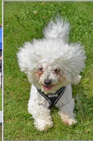
Running Huh!! I'll Show Those Greyhounds How to Run.