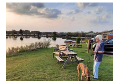
Photo 3 Me being chased