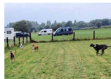
Photo 2 The Group I camped with