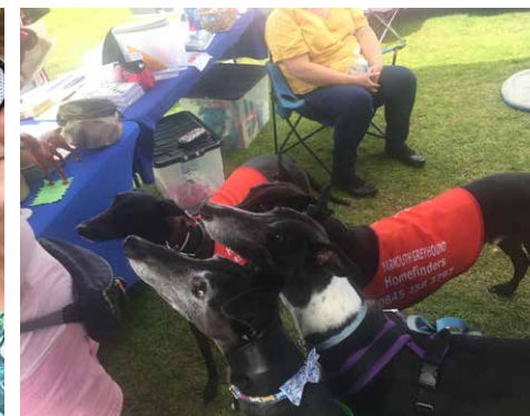
There must have been treats involved!!